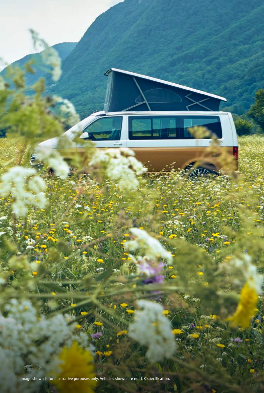
Image shown is for illustrative purposes only. Vehicles shown are not UK specification.